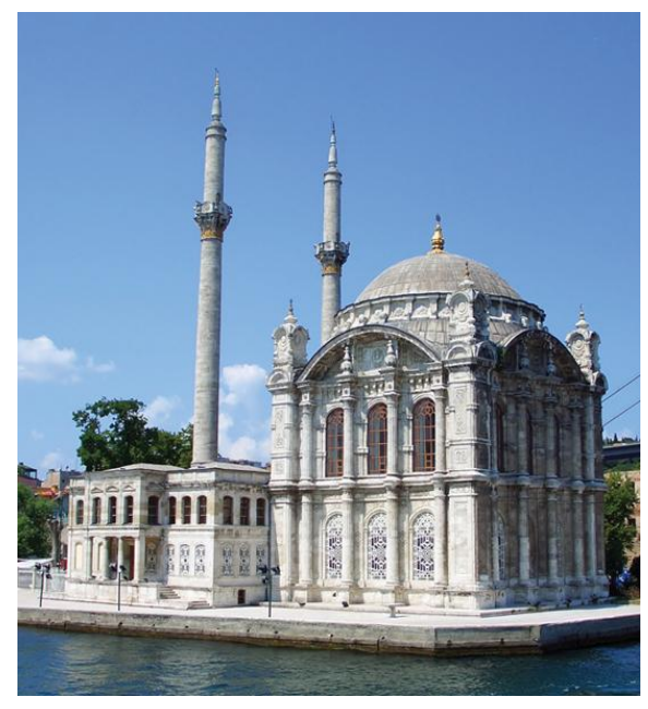
Pictured above is the Ortaköy Mosque, built in the mid-1800s in Istanbul, Turkey.

In this chapter, you will explore the basic beliefs and practices of Islam. You will learn more about the holy book called the Qur'an. Together with the Sunnah (SOON-ah)—the example of Muhammad—this book guides Muslims in the Five Pillars of Islam.