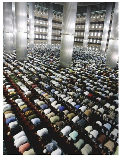
These Muslims are praying during a service at a mosque in Indonesia.

Islam, Judaism, and Christianity have much in common. Members of all three faiths are monotheists (they believe in one God). All three religions trace their origins to Abraham. Their scriptures, or sacred writings, all include such figures as Adam, Noah, and Moses. Muslims believe that all three religions worship the same God.