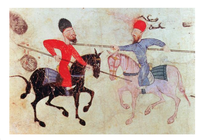
Jihad originally meant a physical struggle against enemies while striving to please God. Sometimes it may be a struggle within an individual to overcome spiritual challenges.

Today, some have used jihad to try to make their government more Islamic or to resist perceived aggression from non-Muslims with acts of terrorism. But most Muslims reject such actions. They agree that to deliberately harm civilians, including non-Muslims, is forbidden in Islam.