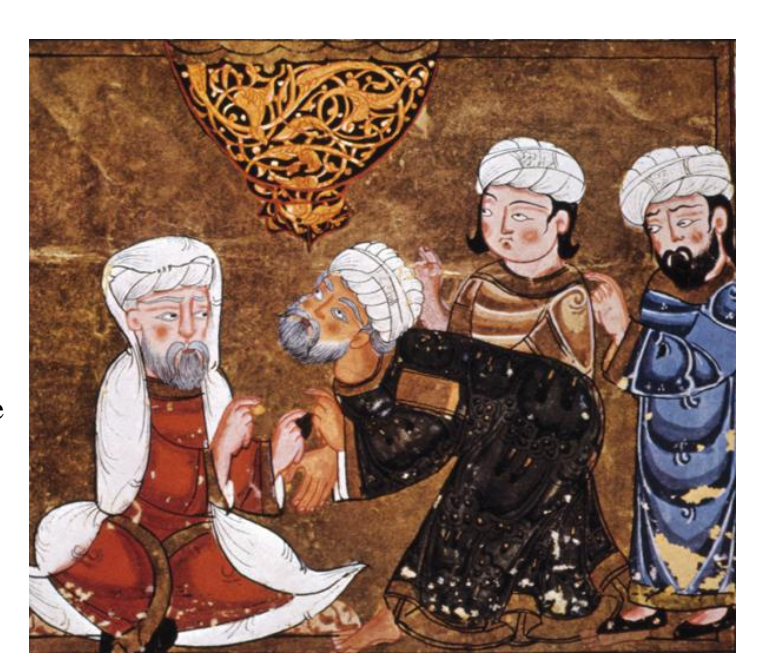
A shari'ah court is shown on this page from an illuminated manuscript dated 1334.

Islamic law guides Muslim life by placing actions into one of five categories: forbidden, discouraged, allowed, recommended, and obligatory (required). Sometimes the law is quite specific. Muslims, for instance, are forbidden to eat pork, drink alcohol, or gamble. But other matters are mentioned in general terms. For example, the Qur'an tells women "not to display their beauty to strangers." For this reason, Muslim women usually wear various forms of modest dress. For example, most women cover their arms and legs. Many also wear scarves over their hair. Others cover themselves from head to toe.