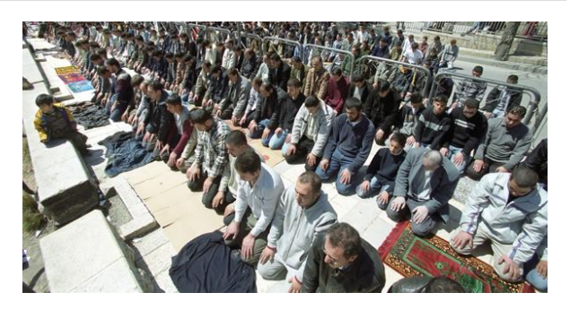
The Islamic community has spread throughout the world. These Muslims in Jerusalem, Isreal, prepare to pray on a sidewalk by facing toward Makkah.

For Muslims, however, the Qur'an contains God's final revelations to the world. They believe that its messages reveal how God wants his followers to act and worship. In the rest of this chapter, you will learn more about the ideas that have shaped the Muslim faith.